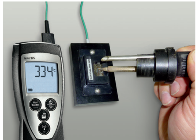
Quick and accurate verification of soldering iron temperature.