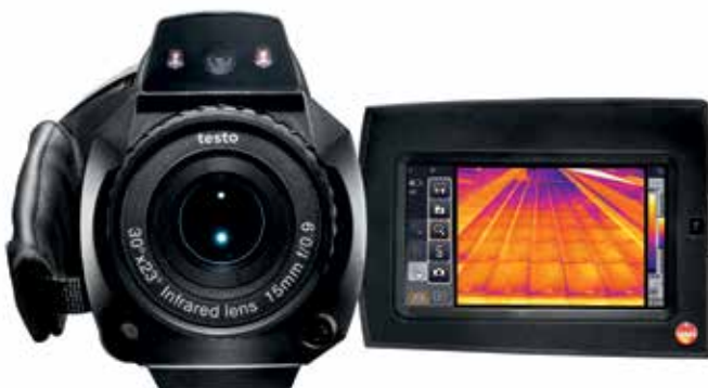
Thermal imager testo 885

More information and answers to all your questions concerning the topics of thermography and photovoltaics at www.testo.com .