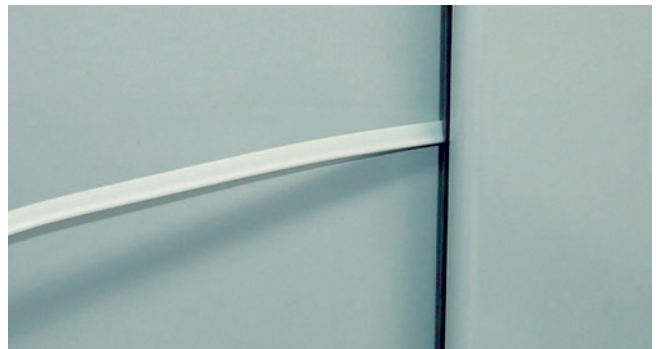
Easy insertion through door seal thanks to ribbon cable.

dk/1/04.2016 Subject to change, including technical changes, without notice.