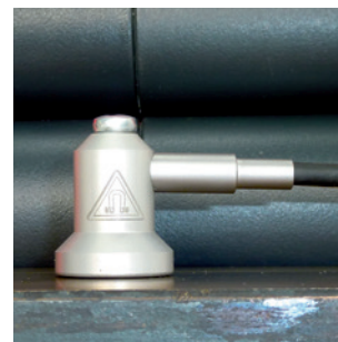
Flat surface with side connection (cable or telescope).

dk/I/05.2016 Subject to change, including technical changes, without notice.