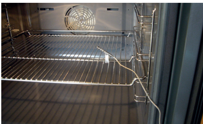
Easy to position in the oven using the mounting clamp