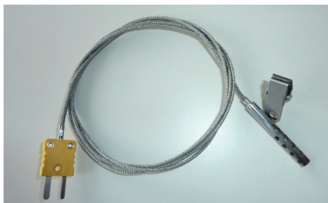
Probe and connecting cable made entirely of stainless steel

Subject to change, including technical changes, without notice. CAC_CS//01.2016