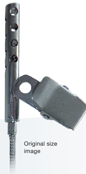
Original size image

Cable length 2 m (other lengths are available)