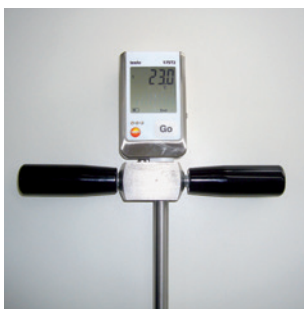
Penetration probe with data logger testo 175-T2