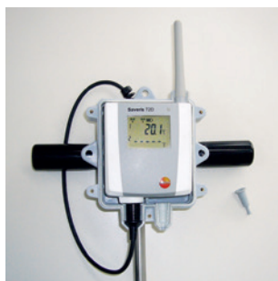
Penetration probe with protective housing for testo Saveris data loggers