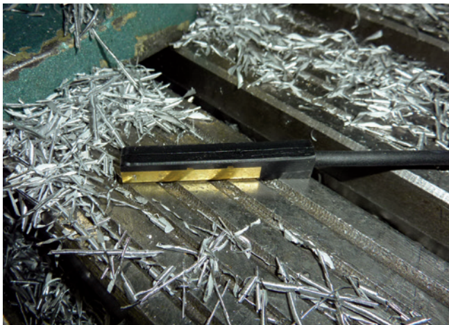
Recording temperature which is included in the expansion compensation.

It is recommended that measuring instruments are used which can evaluate, and which have a min-DIN socket, such as testo720, testo 735, testo loggers, testo Saveris.