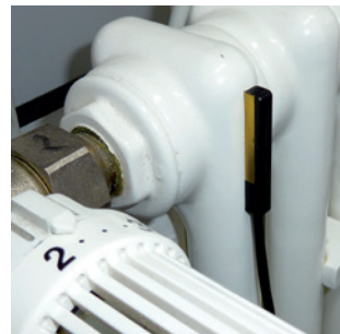
Measurement on a radiator

dk/I/01.2016 Subject to change, including technical changes, without notice.